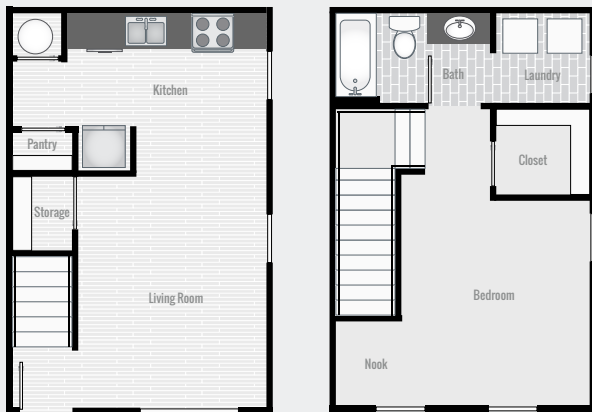
A1 1 BR | 1 BA | 790 SF