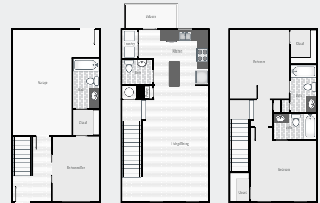
C1 3 BR | 3.5 BA | 1,600 SF