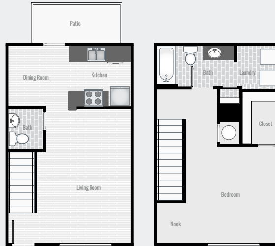
A3 1 BR | 1.5 BA | 920 SF

Contact us and one of our friendly staff members will get in touch with you soon!