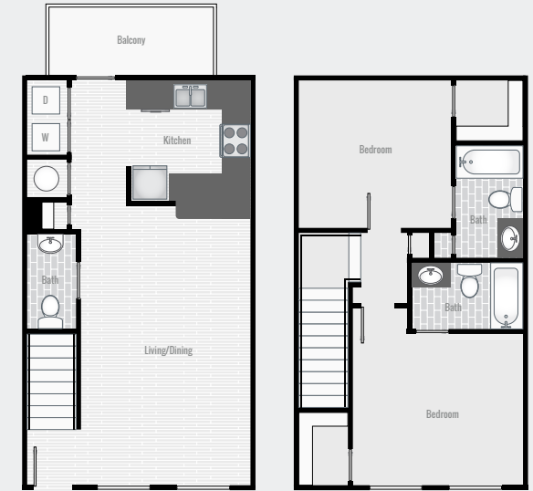
B2 2 BR | 2.5 BA | 1,150 SF