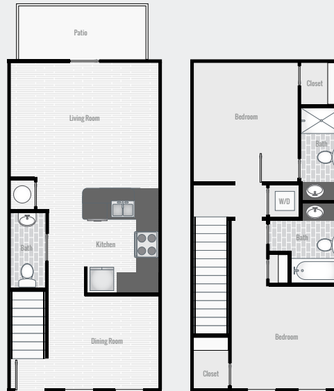
B1 2 BR | 2.5 BA | 1,105 SF